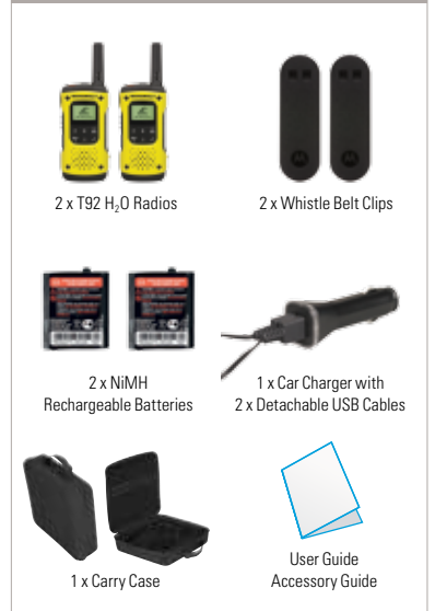
2 x T92 H 2 O Radios