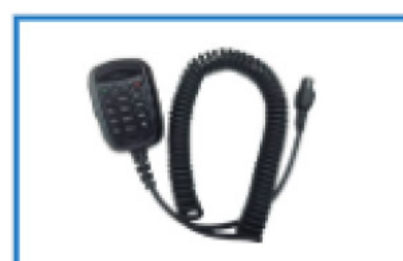
Hand Microphone (with keypad)